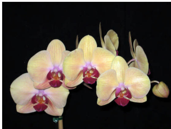
Phal. Golden Beaule

May 17-19 Redland International Orchid Festival Homestead, FL